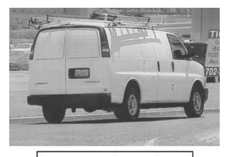
Vans used currently

Homeowners who use the services of a revoked or suspended contractor are not eligible for recovery of their damages through the Residential Recovery Fund. The Board urges the public to hire only licensed contractors in good standing with the NSCB.